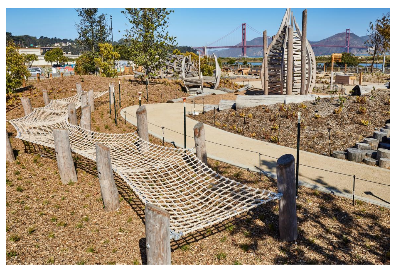
A beautiful view and play area at the Presidio Tunnel Tops.