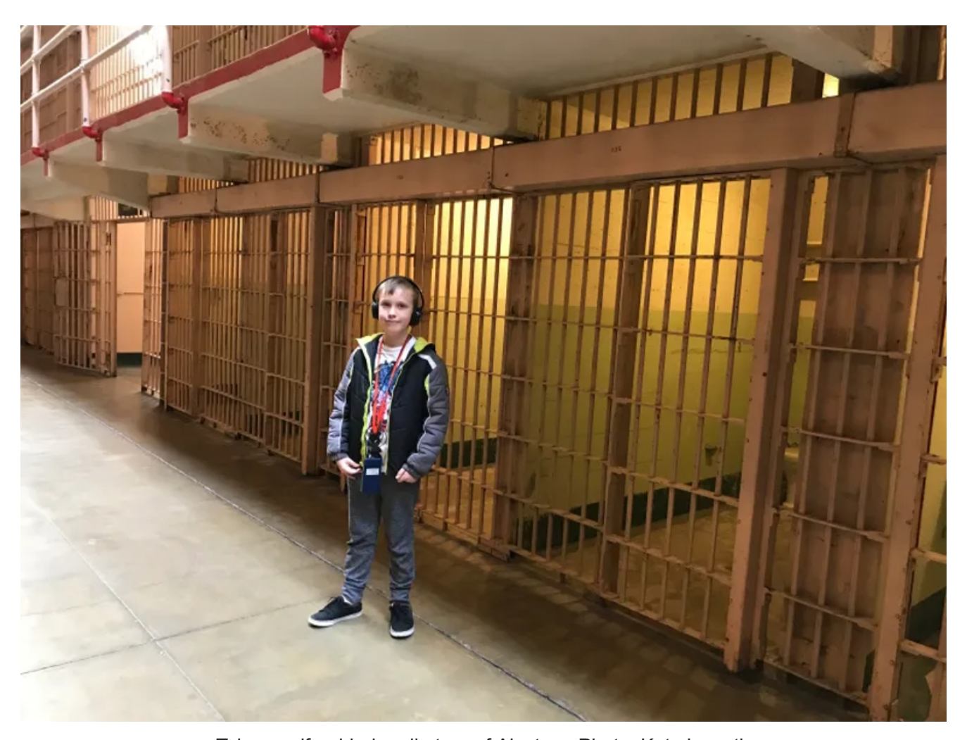
Take a self-guided audio tour of Alcatraz.

official concessioner and not one of the other cruises that only circle the island.