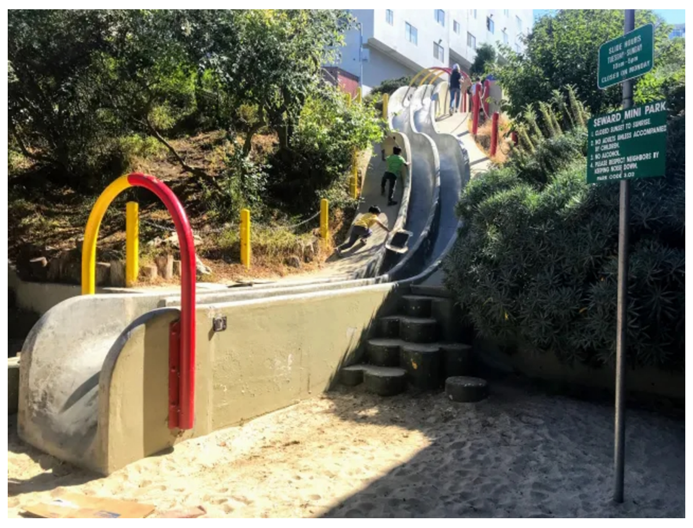
Grab some cardboard and slide!