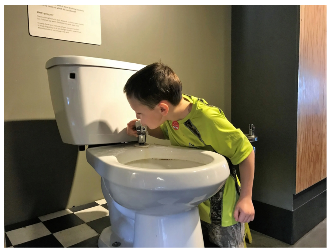
Who could pass up the chance to drink from a toilet?