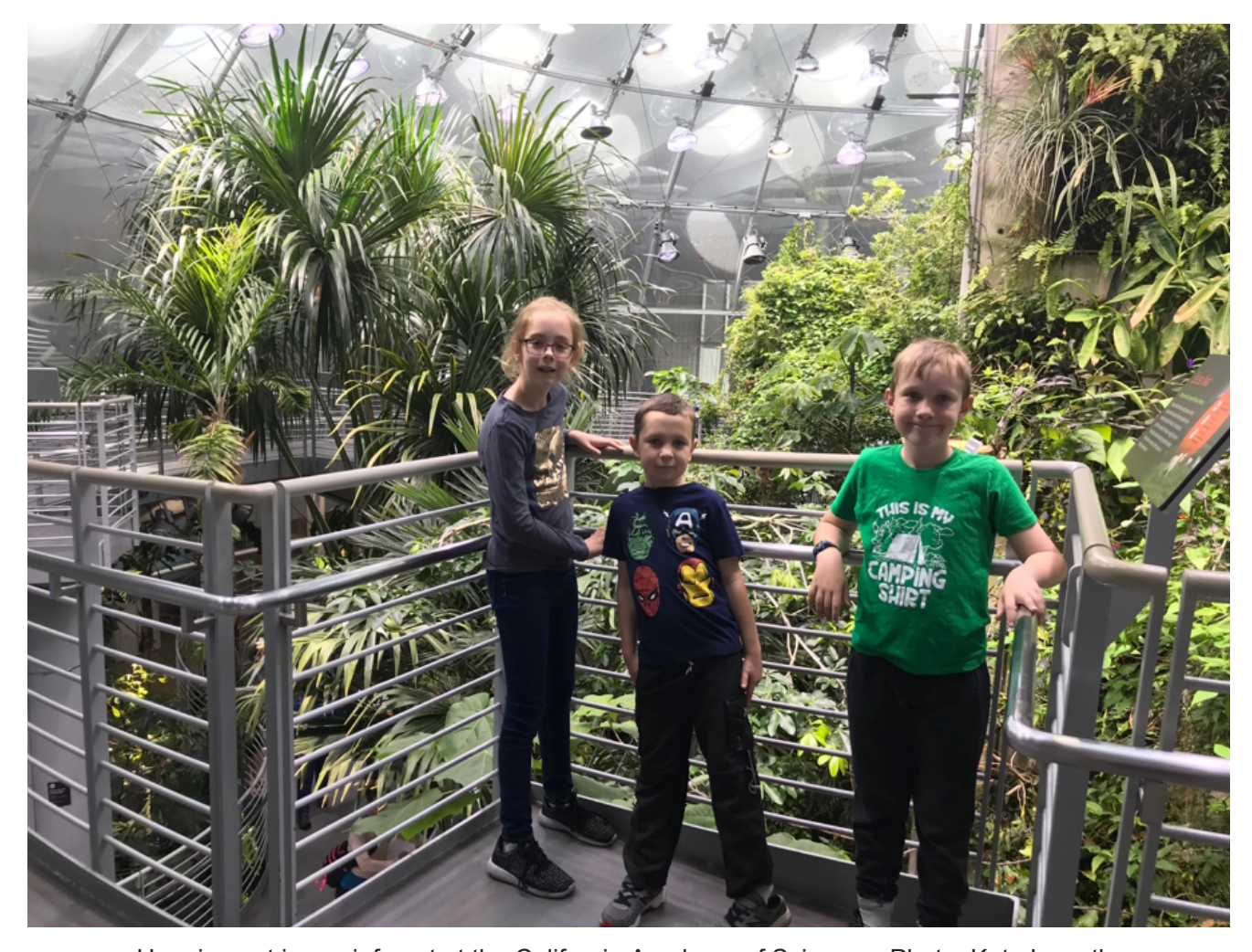
Hanging out in a rainforest at the California Academy of Sciences.

3. Meet an albino crocodile at the California Academy of Sciences. Across the lawn from the de Young is this <u>massive science center</u> that is fun for kids of all ages (and parents, too!). It has an aquarium, a planetarium and a rainforest you can actually walk through. Head up to the living roof for a stunning view of the city and check out the 87-foot blue whale skeleton that will make you feel smaller than ever.